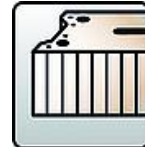
Sand lime brick