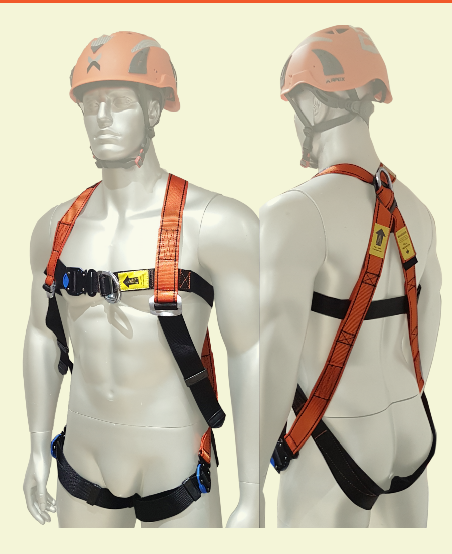
ARESTA Double Point Harness with Eze-Klick Buckles AR-01024

General purpose harness with front and rear D ring attachment point, Quick connect buckles. High comfort webbing. Suitable for general tradesmen, construction workers, roofing, vertical climbing and access equipment. Simple and effective fall arrest harness for total safety compliance.